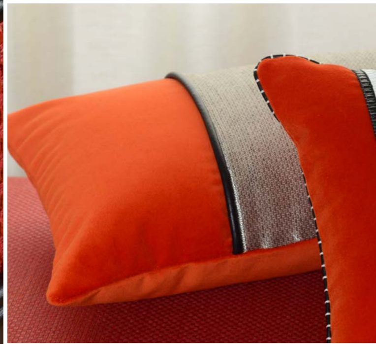
Passepoil - Piping cord - 31104 + col