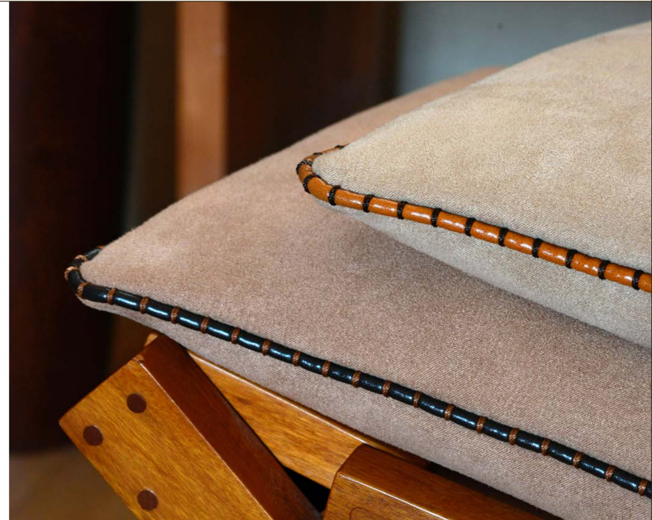
Passepoil surpiqué - Stitched piping cord - 31106 + col