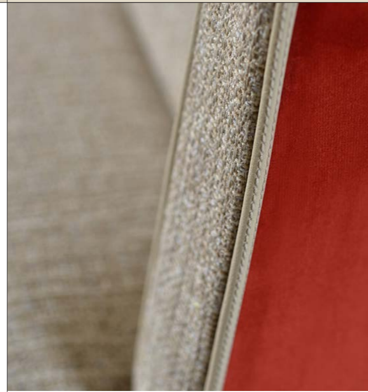
Passepoil faux cuir surpiqué outdoor Faux leather stitched outdoor piping - 31116 + col